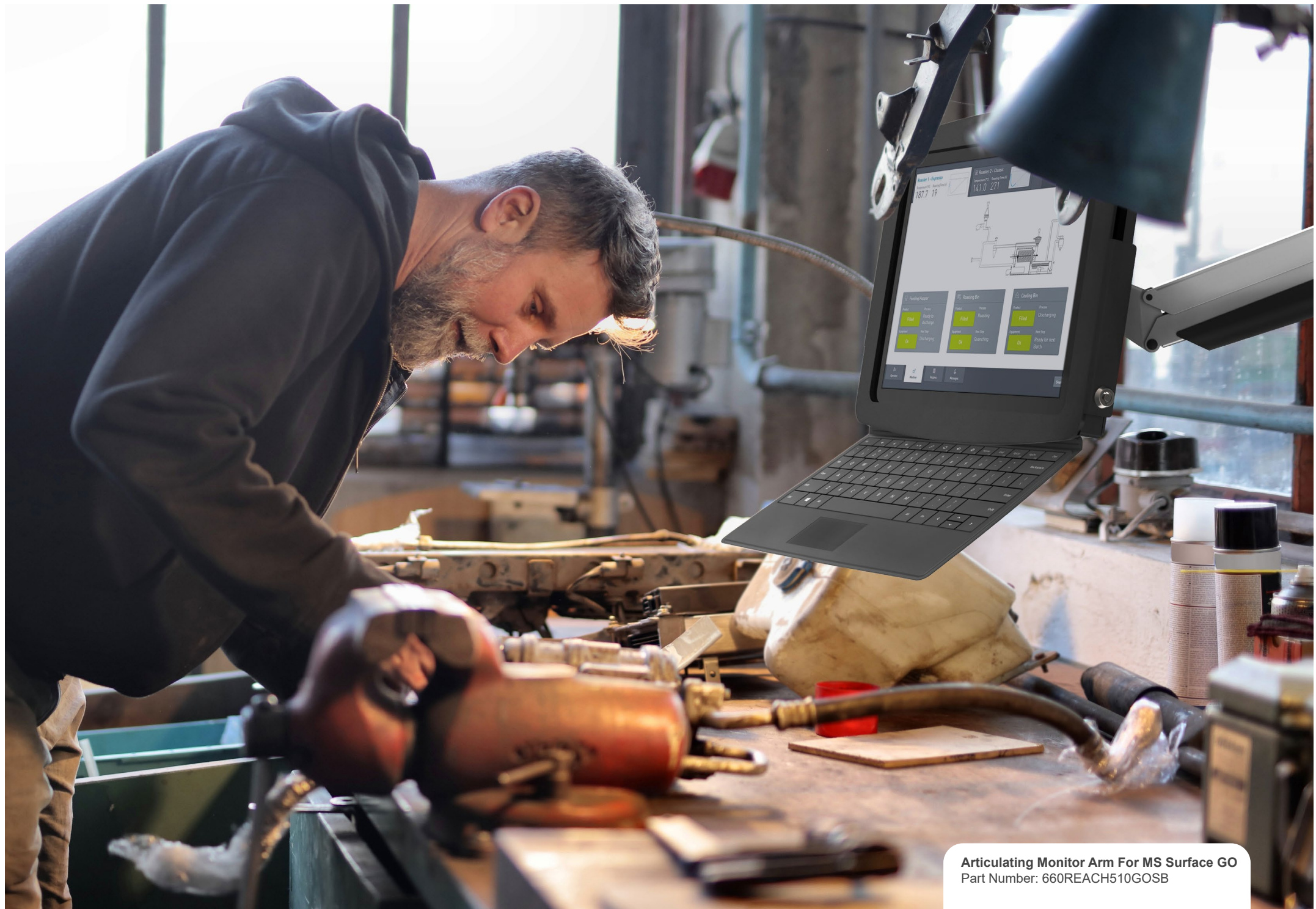
Articulating Monitor Arm For MS Surface GO Part Number: 660REACH510GOSB