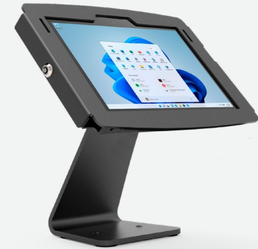
360 Multifunctional Stand For MS Surface GO