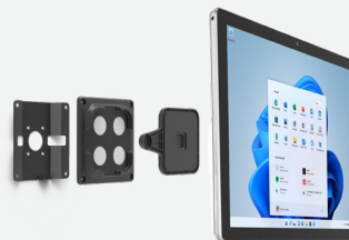
Magnetix Wall Mount