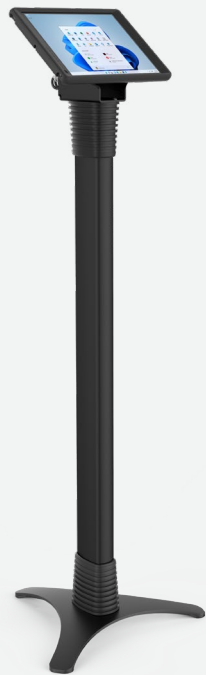
Magnetix Floor Stand