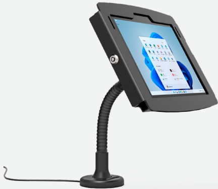
Flexible Arm Kiosk For MS Surface GO