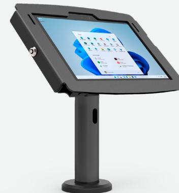
Counter Top Stand For MS Surface GO