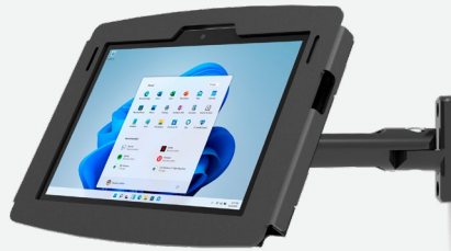
Monitor Arm For MS Surface GO