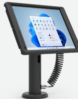
Magnetix Counter Stand