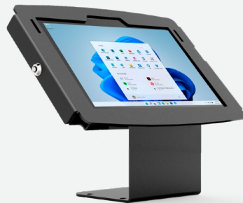
45° Stand For MS Surface GO